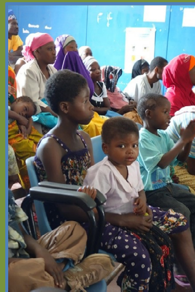
Cacio recording the new arrivals